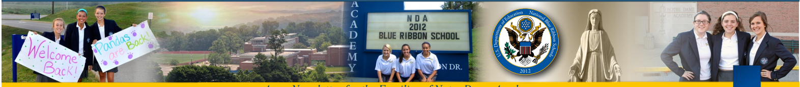
An e-Newsletter for the Families of Notre Dame Academy